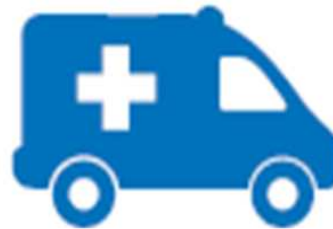
A & E