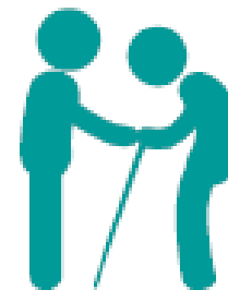
Frail and Elderly