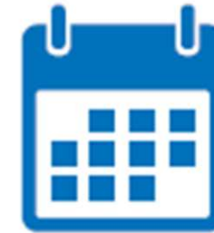
Access and Waiting Times